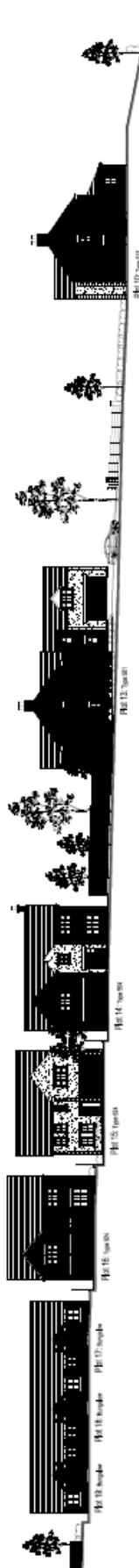
Street Elevation : Plots 10 – 19