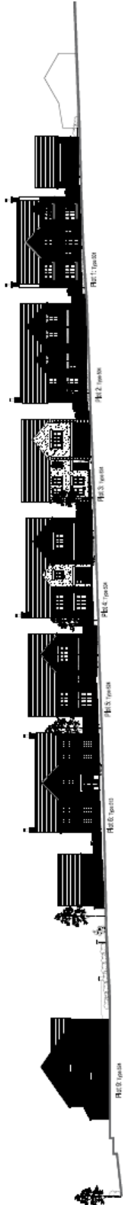
Street Elevation : Plots 1 – 8